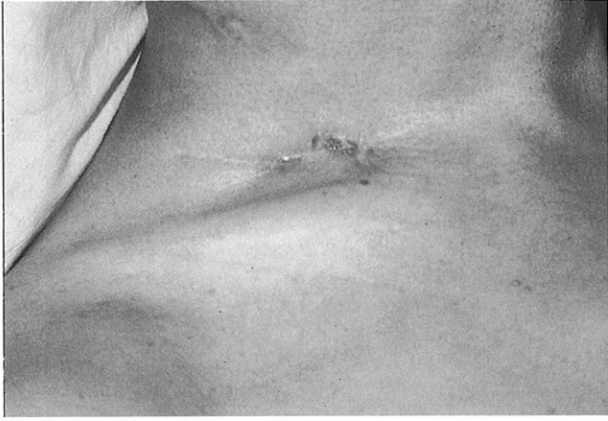
Fig 1 – Discharging sinuses over the neck

10 9 /L, Plt 173 x 10 9 /L) and liver function test were normal. Serum immunoglobulin assays, CD4 and CD8 counts and ratios were also normal. CT scans of the thorax showed a paravertebral soft tissue mass in the upper thoracic spine (Fig 2). Some bony erosion was noted in the C7 to T3 vertebrae. This was suspicious for spinal involvement. Plain radiography of the neck and thorax however did not show any bony erosions. The patient was admitted and treated with intravenous crystalline penicillin 12 million units/day for 8 weeks. The swellings subsided with antibiotics and the sinuses dried up after a month of in-hospital therapy. He had no neurological signs or symptoms referable to the spine. He was thereafter treated with a 6-month course of