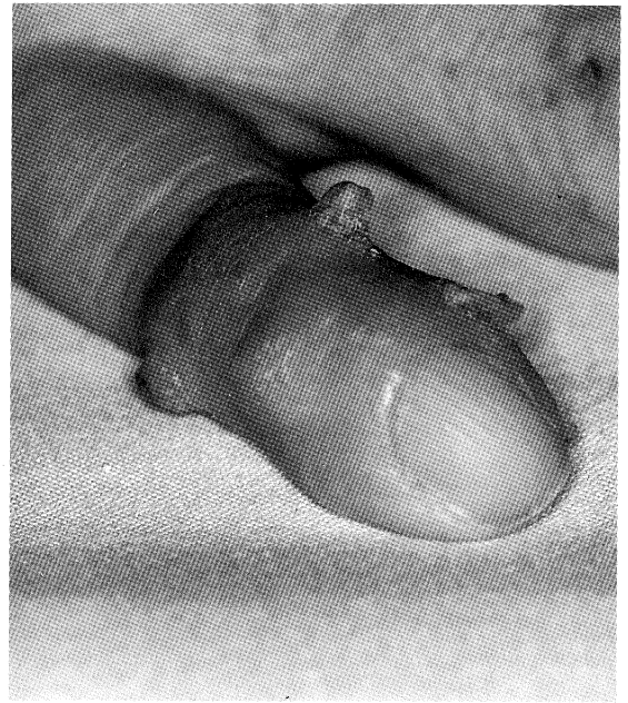
Fig 1 – Right hand: Firm keratotic papules on little finger (patient 1)

A 48-year-old Chinese woman, a non-smoker with a history of asthma and schizophrenia, presented with complaints of shortness of breath of one month's duration. Her family members also gave a history that the patient was on follow-up for years with a private dermatologist for chronic arsenic poisoning with some skin problems. Clinical examinations revealed clubbing of the fingers and toes and a right-sided pleural effusion. There was no evidence of heart or renal failure. Multiple warty keratotic papules were seen distributed over both the palms and the fingers (Fig 1) with generalised hyperpigmentation and "raindrop" hypomelanosis over the left thigh. There were scars on her right palm from a previous excision of squamous cell carcinoma and basal cell carcinoma. Subsequent computer tomography (CT) scan of the thorax revealed a hypodense heterogenous mass in the right lower lobe of the lung with a small peripheral effusion. A CT guided percutaneous fine needle aspiration biopsy revealed malignant cells compatible with undifferentiated small cell carcinoma of the lung. She was subsequently staged and treated with chemotherapy (etoposide). She defaulted follow-up after receiving 3 cycles of treatment.