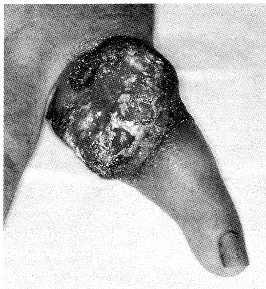
Fig 3 – Left hand: Squamous cell carcinoma ulcerated with an everted edge (patient 3)

Based on the same criteria, the 3 patients reported here appear to be victims of chronic arsenic poisoning (Table I). Except for case 1 who was diagnosed to have arsenic poisoning 8 years ago, the other 2 cases have escaped detection for years and the diagnosis of arsenic poisoning was not made until they presented with advanced neoplastic disease. As can be seen in case 3, he was treated as a case of "infected warts" over his left hand when he first presented to a doctor. Even when the lesions had progressed to a fungating non-healing ulcer, the possibility of chronic arsenic poisoning was not suspected.