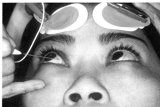
Fig 2 – Administration of BTXA.