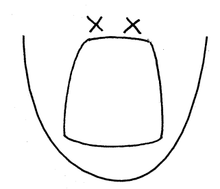
Fig 1 - Diagram showing the 2 sites on the proximal nailfold where intralesional triamcinolone was given.