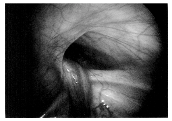
Fig. 3 Laparoscopic view of an inguinal hernia.

hormonal evaluation and laparoscopy showed the vas and the vessels to enter the inguinal canal. Inguinal exploration confirmed a left atrophic inguinal testis and a 'vanished' right testis. A contralateral inguinal hernia (Fig. 3) was incidentally found in an obese 14-year-old for which a herniotomy was also performed. Epididymalgonadal nonunion was found in one intraabdominal testis during conventional orchidopexy, which was not apparent at laparoscopy. Orchidectomy was performed which confirmed epididymal-gonadal nonunion together with peritubular fibrosis and an absence of Leydig cells on histology. All 15 intraabdominal testes were found between the external iliac vessels and the internal inguinal rings.