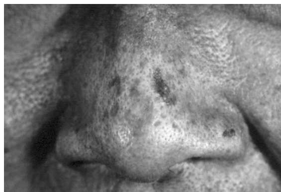
Fig. 1 Denuded blisters on the nose.

On further investigation, she was discovered to have a positive urine porphyrin (Fig. 2). Blood porphyrin and stool porphyrin were however not detected. Further sections of the skin specimen were stained for periodic acid-Schiff (PAS) and these showed cuffs of PAS positive material around the small vessel walls in the dermal papillae and upper dermis (Fig. 3). Other tests to investigate for underlying disorders including the ultrasonography of the hepatobiliary system, hepatitis screen, serum liver function test were