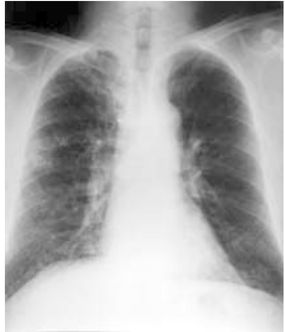
Fig. 1 Chest radiograph demonstrating profuse predominantly basal nodules and tuberculosis infiltration in the right mid-zone.

A 49-year-old Chinese presented in July 1996 with a three-year history of a cough productive of some yellowish green sputum. There was no associated dyspnoea nor wheezing. He had diabetes mellitus for