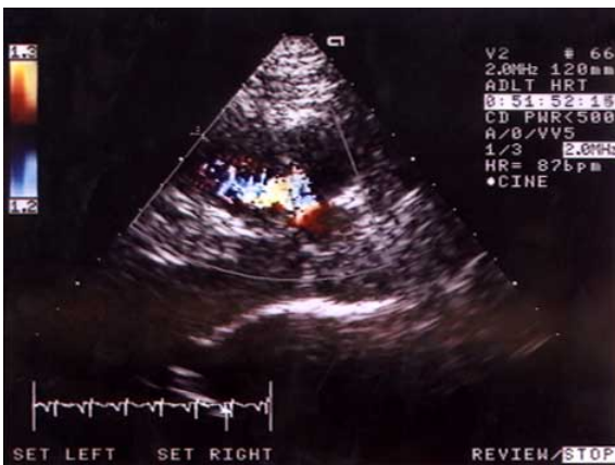
Fig. 3 The typical mosaic colour jet showing the blood flow across a ruptured sinus of Valsalva.

with severe heart failure, 4 (22.2%) with acute chest pain and 2 (11.1%) with cardiogenic shock.