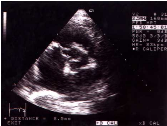
Fig. 2 2-D Echo picture showing the typical 'windsock' appearance of an aneurysm of the sinus of Valsalva.