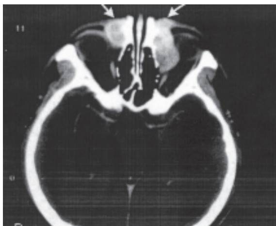
Fig. 2 Axial CT scan of Case 1 showing bilateral antero-medial orbital masses (arrows).