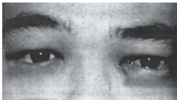
Fig. 1 Case 1: Clinical picture showing swelling in the lacrimal sac area with tearing.

Keywords: Antero-medial orbital mass, Epstein-