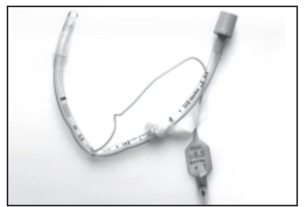
Fig. 3 The defective ETT after 2 months storage in a cool environment.