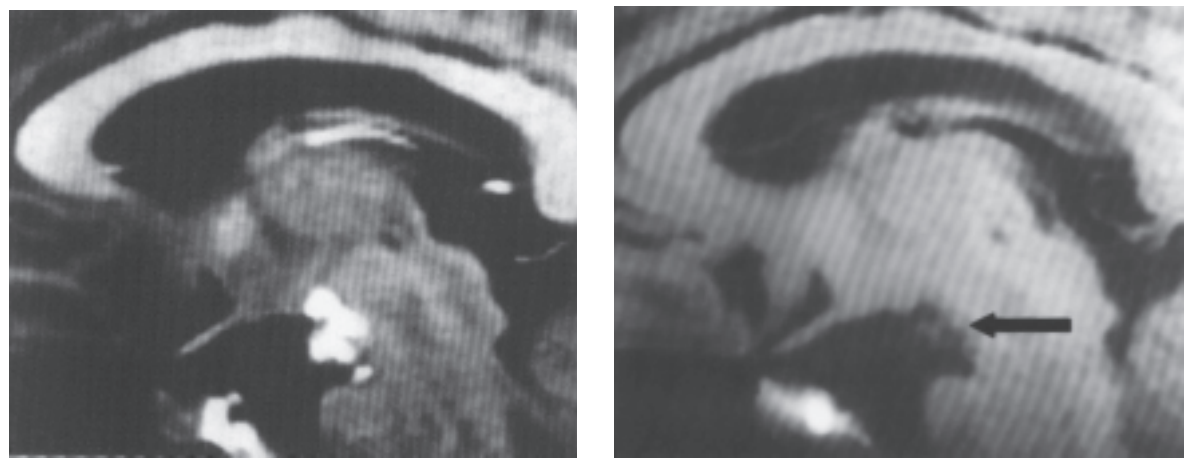
Fig. 2 Sagittal TI-weighted images taken (a) without and (b) after fat suppression show a lobulated hyperintense lesion, which becomes hypointense (arrow) on the fat suppression image.

lesions grow very slowly and rarely cause symptoms. Epilepsy is the most common symptom associated with ICLs. Rarely, they cause hydrocephalus due to obstruction of cerebrospinal fluid pathways or by mass effect. In such cases, debulking of the lesion relieves the symptoms<sup>(3)</sup>.