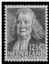
Cover Picture: Hermann Boerhaave (1668-1738): 18 th Century Teacher Extraordinaire (Refer to page 3-5)

Permit No MITA (P) 111/09/2002 ISSN 0037 - 5675