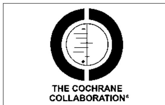
Fig.2 The Cochrane Collaboration's logo incorporates a forest plot.

Systematic reviews appear at the top of the hierarchy of evidence. This reflects the fact that, when rigorously conducted, they should give us the best possible estimate of any true effect. However, caution must be exercised before accepting the findings of any systematic review without first appraising it. Like any piece of research, a systematic review may be done poorly. Not all systematic reviews are rigorous and unbiased. Little attention may have been paid to the intervention, the patient selection group or the search strategy; or the systematic review may have combined studies in meta-analysis which should not have been pooled because they differ in terms of intervention used or participants included. Therefore, it is important that users of systematic reviews become familiar with the steps involved