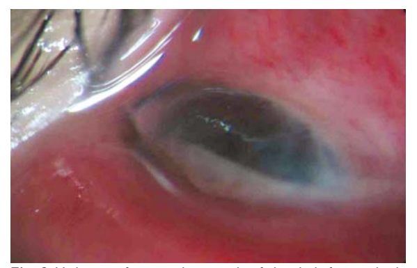
Fig. 2 High magnification photograph of the dark foreign body embedded in the inferotemporal conjunctival fornix of the right eye.