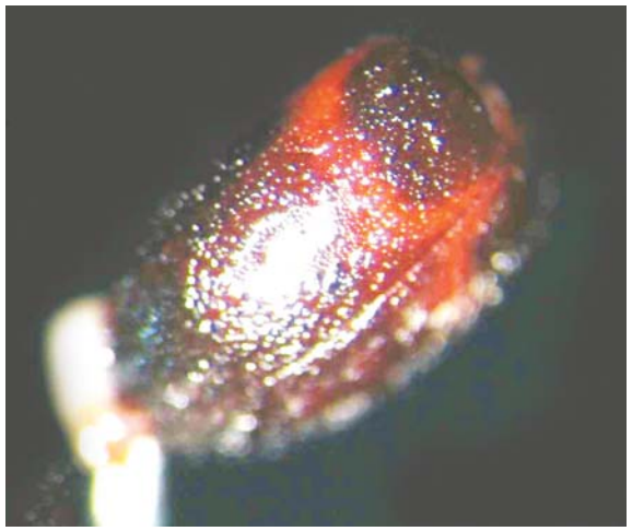
Fig. 4 Photograph of the body of insect removed from the conjunctival fornix.

In addition, prompt handling and identification of the insect species may help in the case management, bearing in mind that some beetles have toxic substances coating their bodies<sup>(7)</sup> and if allowed to have prolonged contact with the eye, may lead to more serious ocular injuries. Blister beetles, also known as Nairobi flies, are commonly found in East Africa. They have a similar size to the beetle found in our case and have been known to cause keratoconjuctivitis, corneal ulcers, severe lid and periorbital oedema after just a brief contact with the eye<sup>(7)</sup>. If a Blister beetle was lodged in the eye for prolonged period of time, it may cause more severe and irreversible damage.