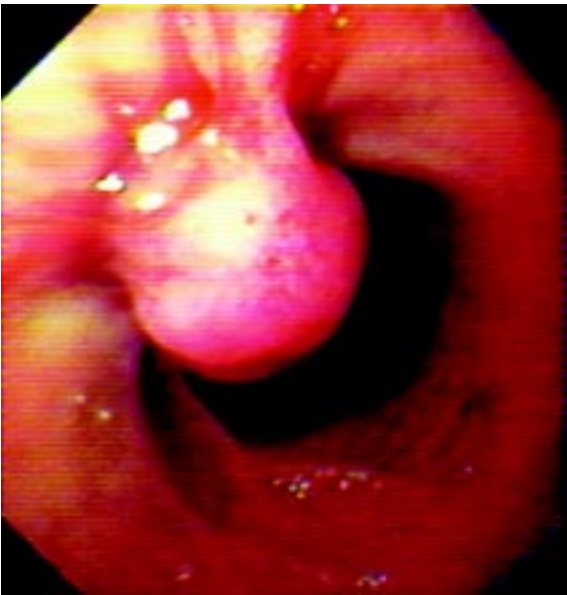
Fig. 3 Endoscopy photograph shows the successfully-banded duodenal varix.