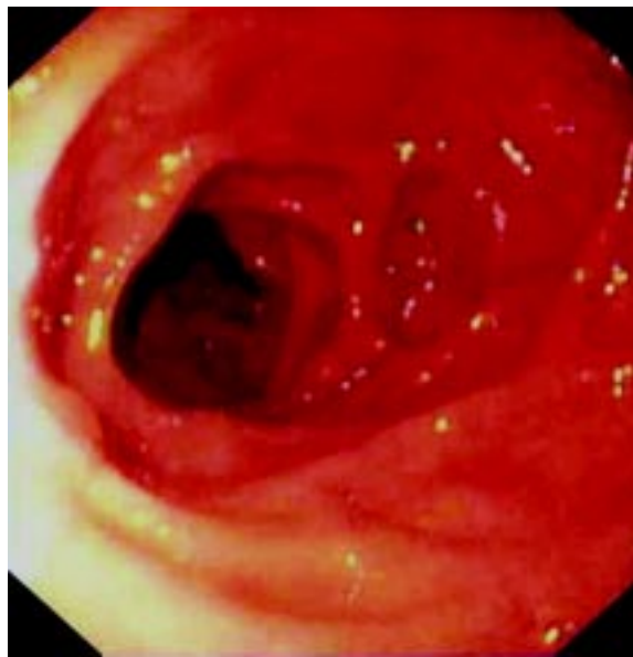
Fig. 2 Follow-up endoscopy done one year post-banding. Photograph shows complete regression of the duodenal varix.

hepatofugal blood flow through the cystic branch of the superior mesenteric vein, superior and inferior pancreaticoduodenal veins, and gastroduodenal and pyloric veins (1) . Such varices are less effective in lowering the portal pressure, compared with oesophageal and gastric varices.