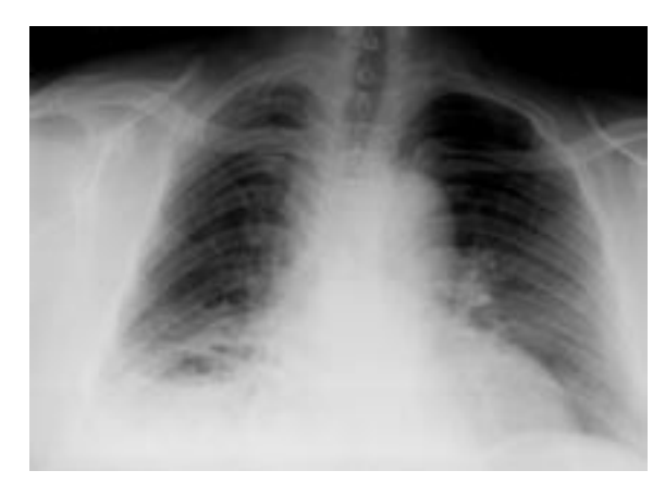
Fig. I Chest radiograph shows right lower lobe bronchiectasis and partial collapse.