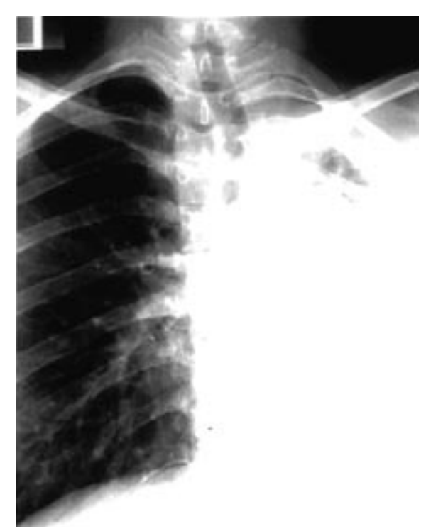
Fig. 3 Chest radiograph shows extensive left-sided fibrosis.

endobronchial mass was seen in right lower lobe bronchus (Fig. 2). An endobronchial biopsy was done which revealed vegetable matter. She subsequently underwent a rigid bronchoscopy and removal of the foreign body from the right lower lobe bronchus. The foreign body was confirmed to be a tamarind seed. She recovered from her pneumonia. However, she had significant residual bronchiectasis.