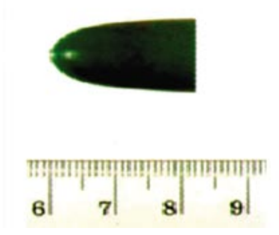
Fig. 4 Photograph shows the plastic feed of a fountain pen.

Our four cases of foreign body aspiration, two with betel nuts, one with tamarind seed and one with plastic feed of a fountain pen, demonstrate the potential considerable morbidity associated with this condition. Three of our patients presented many months after the inhalation episode, and one did not even remember the initial episode. The diagnosis was missed previously in all cases, and in one case, two courses of anti-tuberculous therapy were given