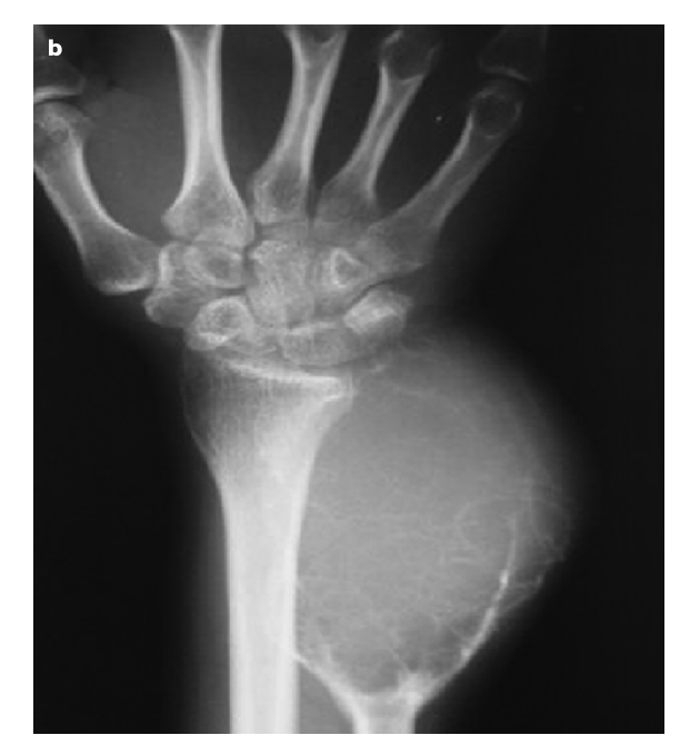
Fig. I Case no. 20. A 30-year-old man presented with progressive swelling of distal ulna. There was significant soft tissue infiltration by a markedly hypervascular tumour. He was treated with wide resection and wrist fusion. He remained disease-free three years after surgery. (a) Clinical photograph shows the large distal forearm swelling. (b) Radiograph shows expansile lytic lesion with cortical break. (c) Surgical photograph shows a hypervascular tumour and soft tissue infiltration.

of the bone were observed in all patients. No histological evidence of malignant transformation was seen in any of the cases. Wide margin with 1 cm surrounding normal soft tissue was achieved in 16 cases and marginal of 1-2 mm in another four patients. Four patients with ulcers showed infiltration of the skin and the subcutaneous tissue. Amputation was the primary mode of surgical treatment in two patients. One patient presented with metachronous lesion of distal femur and distal radius. The lesion in distal femur had massive soft tissue infiltration and neurovascular infiltration posteriorly that precluded limb salvage surgery. Another patient presented nine years after initial diagnosis with aggressive behaviour and massive soft tissue and neurovascular involvement.