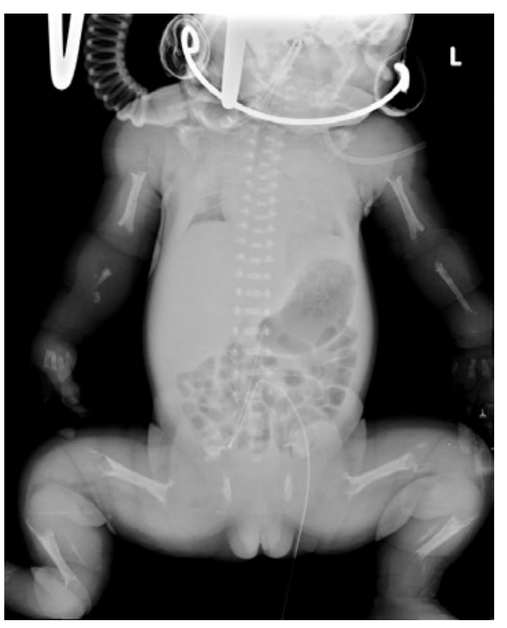
Fig. I Frontal radiograph of the trunk and limbs of the neonate.

Kritsaneepaiboon S, Jaruratanasirikul S, Dissaneevate S