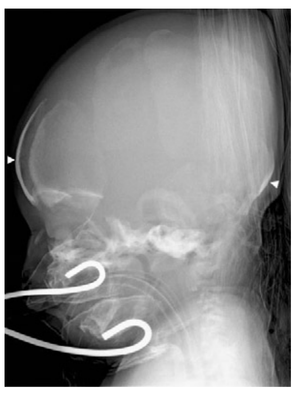
Fig. 3 PLH. Lateral skull radiograph shows diffuse demineralisation with calcification in frontal and occipital bone (arrowheads).

In the infantile form, the clinical signs appear before six months of age, and include features such as poor feeding, premature craniosynostosis and manifestations of rickets e.g. broad wide ankles and wrists, bowing legs and rachitic rosary. The radiographical features are similar to those of rickets, namely: cupping and fraying of metaphyses of long bones with widened growth plates and spotty demineralisation of the epiphyses<sup>(1,7)</sup>. Deformities of the anterior ends of the ribs in hypophosphatasia are widening and irregular cupping, in contrast to the