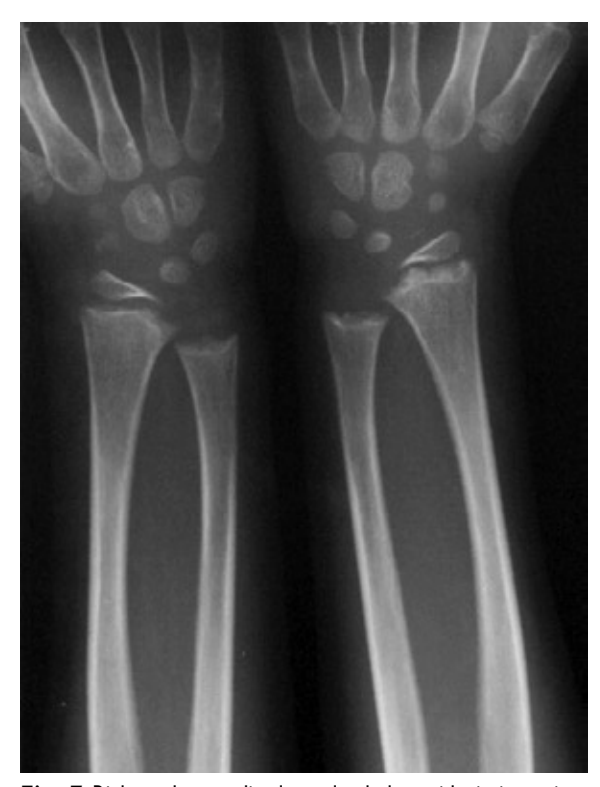
Fig. 7 Rickets due to distal renal tubular acidosis in a nineyear-old girl. Radiograph of both forearms shows metaphyseal irregularities and flaring similar to hypophosphatasia. The physes are widened from loss of zone of provisional calcification. Delayed bone age is also evident.