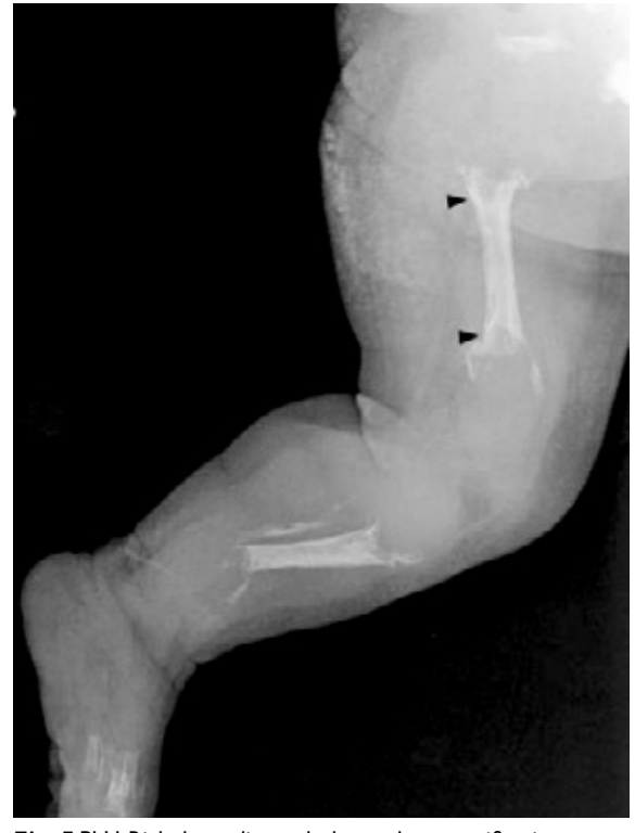
Fig. 5 PLH. Right leg radiograph shows absent ossification centre of the epiphyses at the distal femur, proximal tibia, talus and calcaneus which should be seen in the full-term infant. The right fibula is poorly ossified. The metaphyses of the femur and tibia show irregularity and cupping. There are prominent radiolucent or "tongue-like" lesions of unossified osteoid protruding into the central portion of the proximal and distal metaphyses of the right femur (arrowheads).