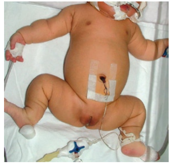
Fig. 2 Clinical photograph of a patient with PLH shows short proximal and distal limbs, indicating micromelic dwarfism.

The perinatal (lethal) form is expressed inutero, causing stillbirth or death within a few days of life, and has the poorest prognosis<sup>(5,7)</sup>. There is a wide spectrum of clinical and radiographical abnormalities in this form. The patient shows shortlimbed dwarfism (micromelic type) and bowing of lower extremities (Fig. 2). The calvarium is soft due to profound hypomineralisation, resulting in the "caput membranaceum"<sup>(2,5)</sup> or an appearance like a bag of fluid<sup>(1)</sup>. Skin-covered osteochondral spurs (called Bowdler spurs) may be seen protruding from the midshaft of forearms or legs<sup>(3,5,8,)</sup>. They usually underlie dimples on the skin and present at birth, persisting until childhood or even adulthood<sup>(9)</sup>. These spurs only rarely first present in adolescence. If the spurs are seen in an adolescent patient, it is believed that they may indicate the benign perinatal form<sup>(10)</sup>.