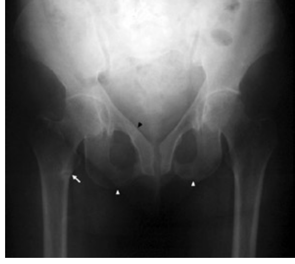
Fig. 8 Oncogenic osteomalacia from a benign tumour at the left knee in a 35-year-old woman. Anteroposterior pelvic radiograph shows multiple old healed pseudofractures at the right superior and inferior pubic rami, left inferior pubic ramus (arrowheads) and right proximal femur (arrow). The notable feature is the looser zone in the affected medial cortex of the right proximal femur (arrow) which is different from the hypophosphatasia affecting the lateral cortex.

deformities of the ribs in rickets which are widened and uniformly washed out<sup>(9)</sup>.