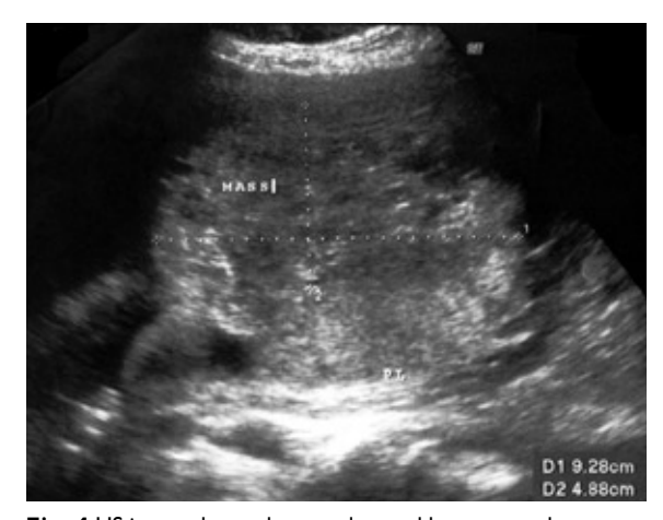
Fig. 4 US image shows the pre-placental haematoma has grown to a size of 9.3 cm in largest diameter at 32 weeks gestation [MASS: pre-placental haematoma; PL: Placenta].

At 26 weeks, the subchorionic haematoma was noted to be 6.5 cm in largest diameter while the pre-placental haematoma also measured 6.5 cm in largest diameter. While the subchorionic haematoma diminished in size over time, the pre-placental haematoma continued to grow, measuring 9.0 cm at 28 weeks, and 9.3 cm at 32 weeks (Fig. 4). During this time, her haemoglobin level remained stable at around 10.0 g/dL. Her platelet count and clotting profile were normal. Kleihauer Betke test was negative as was her thrombophilia screen.