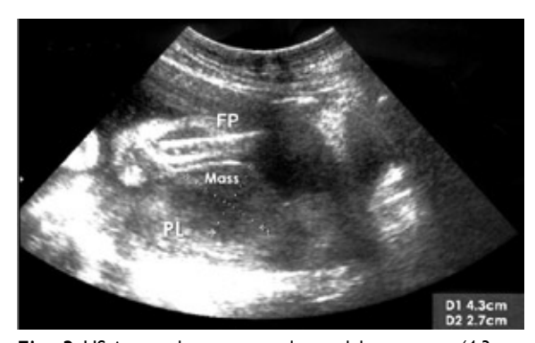
Fig. 3 US image shows a pre-placental haematoma (4.3 cm in largest diameter) seen on the surface of the placenta at 25 weeks gestation [MASS: pre-placental haematoma; FP: foetal parts; PL: placenta].

At 26 weeks, the subchorionic haematoma was noted to be 6.5 cm in largest diameter while the pre-placental haematoma also measured 6.5 cm in largest diameter. While the subchorionic haematoma diminished in size over time, the pre-placental haematoma continued to grow, measuring 9.0 cm at 28 weeks, and 9.3 cm at 32 weeks (Fig. 4). During this time, her haemoglobin level remained stable at around 10.0 g/dL. Her platelet count and clotting profile were normal. Kleihauer Betke test was negative as was her thrombophilia screen.