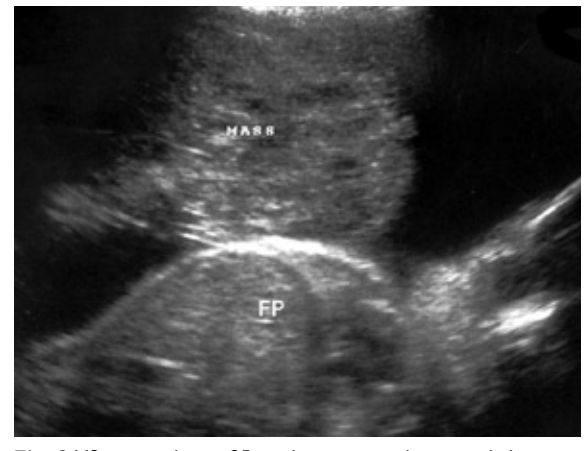
Fig. 2 US image taken at 25 weeks gestation shows a subchorionic haematoma (5.0 cm in largest diameter) in the lower posterior uterine wall [MASS: subchorionic haematoma; FP: foetal parts].

The bleeding resolved but she was readmitted at 25 weeks with recurrent APH and contractions. US then showed a subchorionic haematoma (Fig. 2) in the lower posterior uterine wall measuring 5.0 cm in largest diameter. There was also a separate irregular multiloculated structure measuring 4.3 cm in largest diameter on the surface of the placenta, attributed to a pre-placental haematoma (Fig. 3), with the cord inserting into the centre of the structure. Colour Doppler US showed no blood flow within both lesions. Amniotic volume was normal and there were no hydropic features noted in the foetus, which showed normal growth parameters and normal Doppler flow. She was managed conservatively with oral adalat for tocolysis as well as twice-weekly IM 17 alpha-hydroxyprogesterone caproate.