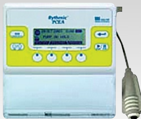
A patient-controlled epidural analgesia pump.

In a review of 18 randomised trials which used PCEA in labour analgesia, PCEA has been shown to offer several advantages over both intermittent nurse-administered dosing and continuous infusion techniques. The advantages of PCEA over continuous epidural infusion include reduced local anaesthetic used, less motor blockade, lower pain scores, improved maternal satisfaction and less anaesthetic interventions with possible decrease in staff workload (11) .