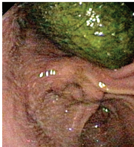
Fig. 1 Endoscopic photograph shows the trichobezoar in the stomach.

Chewing on or eating hair or any indigestible materials can lead to the formation of a bezoar. A bezoar is a ball of swallowed foreign material (usually hair or fibre) that collects in the stomach and fails to pass through the intestines. The risk is greater among the mentally retarded or emotionally disturbed children. Generally, bezoars are seen in female patients (approximately 90%) aged 10–19 years and only half of the patients have a history of trichophagia. (1) Trichobezoars can result in anaemia, abdominal pain, haematemesis, nausea and/or vomiting, bowel obstruction, gastric ulcers, perforation, gastrointestinal bleeding, acute pancreatitis, and obstructive jaundice. Contiguous extension of a trichobezoar into the small bowel can lead to the “Rapunzel syndrome”. The combination of a gastric hairball and a “hairtail” in the jejunum is known as the Rapunzel syndrome, first described in