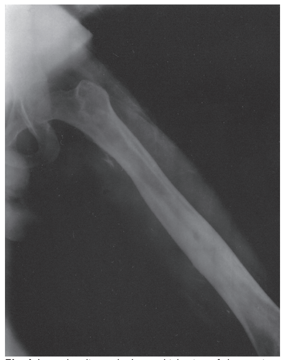
Fig. I Lateral radiograph shows thickening of the cortices with widening of the mid-shaft and a few well-defined lytic lesions, surrounded by sclerosis in the shaft of the left femur.

Granulomatous infection of the bone is one of the most common orthopaedic problems in third world countries, including India. (1) Burkholderia pseudomallei (B. pseudomallei), the causative organism of melioidosis, is a very rare isolate from chronic granulomatous osteomyelitis. It is often resistant to antibiotics chosen to treat bacterial infections as it can mimic chronic pyogenic osteomyelitis or tubercular osteomyelitis in presentation.(2) It is therefore not unlikely to assign an incorrect aetiology. Moreover, a mistaken diagnosis of this "category two" organism may lead to improper antibiotic therapy, and hence, failure of treatment. The identification of the pathogen in the microbiology set-up is the most direct and the best way to diagnose melioidosis of the bone. Most B. pseudomallei are susceptible to ceftazidime, amoxiclavulanic acid, cotrimoxazole and chloramphenicol and resistant to third generation cephalosporins, aminoglycosides and polymyxin B.(3) Amoxi-clavulanic acid alone is often associated with a higher failure rate. We report a very rare presentation of melioidosis as chronic granulomatous osteomyelitis with atypical drug sensitivity pattern which alerts the clinician regarding this unusual organism causing osteomyelitis.