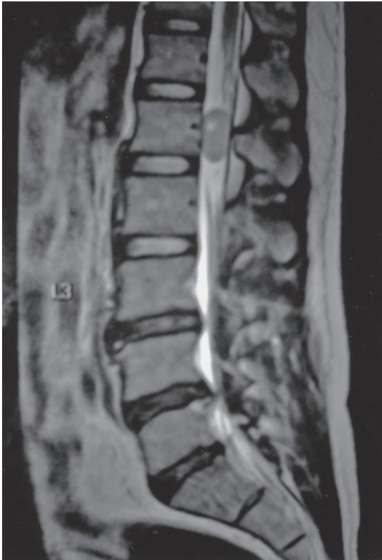
Fig. 1 Preoperative sagittal T2-weighted lumbosacral MR imaging shows tumour at L1 vertebral level.