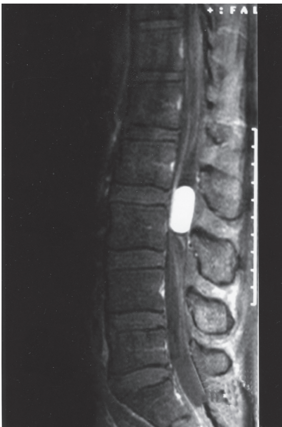
Fig. 3 Preoperative contrast-enhanced T1-weighted lumbosacral MR imaging shows tumour at L2/3 interspace.