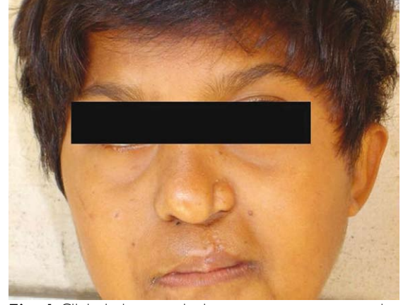
Fig. 1 Clinical photograph shows nose asymmetry and a scar over the left nostril and upper lip.

A 16-year-old boy presented to our surgical outpatient clinic for the absence of both testes since birth. For