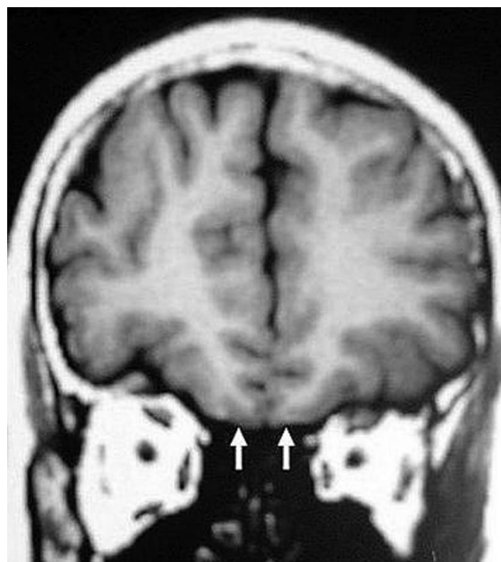
Fig. 3 Coronal TI-W MR image shows a hypoplastic olfactory bulb with ill-defined olfactory tract and sulci (arrows).

penis (stretched penile length 2.3 cm). The scrotum was small but had rugosities (Fig. 2). The testes were palpable at the root of the scrotum but were small and very soft.