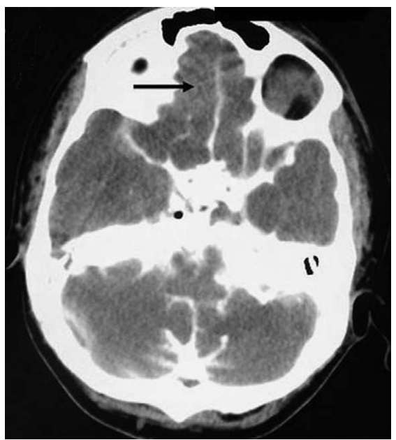
Fig. 4a Axial CT cisternogram shows partial filling of the right olfactory groove (arrow) and lack of filling of the left olfactory groove due to hypoplasin.