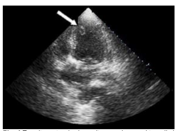
Fig. I Two-dimensional echocardiogram shows a thin-walled cyst (arrow) attached to the left ventricular wall.

A 42-year-old woman underwent thyroidectomy for a multinodular goitre presenting with pressure symptoms. Following surgery, she developed hypocalcaemia and was admitted for intravenous calcium replacement. During her stay in the ward, she developed suddenonset left hemiparesis which was not associated with headache, vomiting or seizures. There was no past history of fever, joint pain, or other systemic manifestations. She had history of hypertension. On physical examination, her blood pressure was 130/ 80 mmHg, heart rate was 80/minute, and her temperature was 36.6°C. Her pulse was regular and there was no carotid bruit. She did not have pallor, icterus, lymphadenopathy or engorgement of neck veins. She had a left hemiparesis [power grade 2 left lower limb, grade 1 left upper limb]. Optic fundi