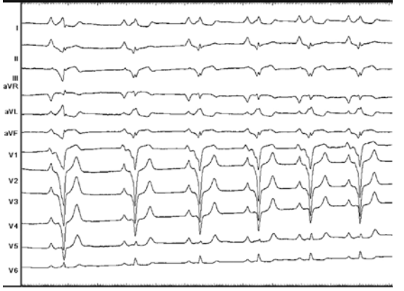
Fig. I 12-lead ECG shows short PR interval and delta waves suggestive of right free wall accessory pathway.

The patient was a 23-year-old woman who presented with a history of recurrent episodes of palpitation for a few years and dyspnoea on exertion for a few months. She