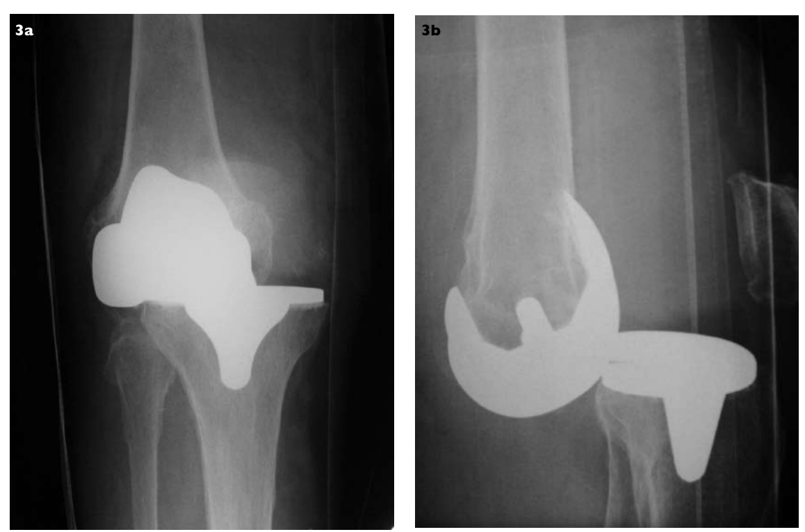
Fig. 3 Case 2. (a) Frontal and (b) lateral radiographs show post-total knee arthroplasty dislocation.

the posterior structures. On both her knees, the surgical wounds healed without any complication. On the 25th day post-total knee arthroplasty, deformity and pain of the left knee prompted us to have radiographs taken. Radiographs showed a posterior dislocation of the left knee. Reduction was done under image intensifier