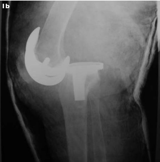
Fig. 1 Case I. (a) Frontal and (b) lateral radiographs show post-total knee arthroplasty dislocation.

of a walking frame. On the 11th day, the patient fell in the toilet and was brought in with a fracture of her right patella. Open reduction and tension band wiring was done for the right patella. Postoperatively, both knees were kept in braces in extension, and ambulation was resumed with support. The left knee was noted to have a fixed flexion deformity that was increasing slowly and progressively. Hence, passive extension was included in the physiotherapy, in order to stretch