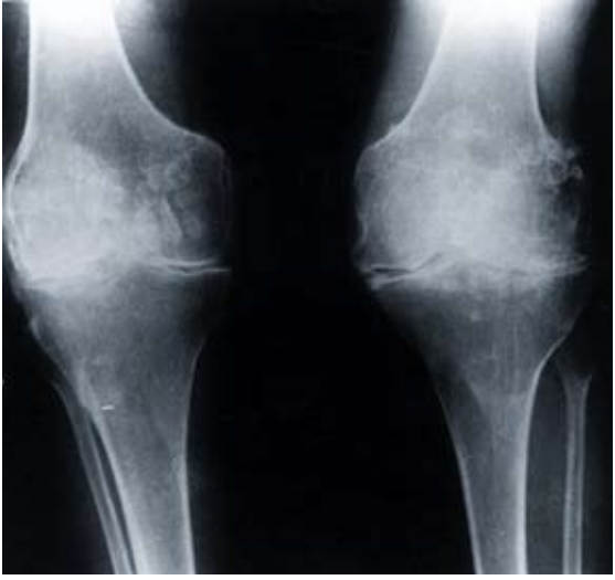
Fig. 2 Radiograph of the knee joints shows degenerative changes and synovial osteochondromatosis.

joints were swollen. Skeletal radiography revealed severe osteoarthritis of all the major joints, including the distal and proximal interphalangeal joints in both hands. In addition, there was synovial osteochondromatosis of both glenohumeral and knee joints (Figs. 1 & 2). Dorsal and lumbar spine revealed platyspondyly, multiple osteophytes and irregular endplates of most of the vertebrae (Fig. 3). Both femoral necks were short