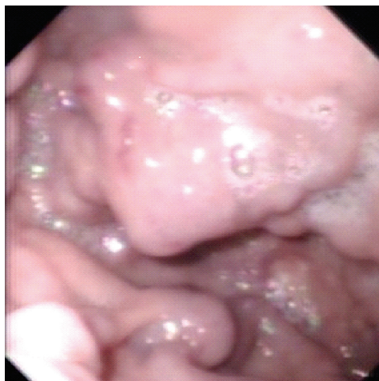
Fig. 1 Endoscopic photograph shows a large fundal varix with the red mark of recent bleed.

Our patient, a 50-year-old woman from the north of Pakistan, came to the emergency room with a history of four episodes of haematemesis and two episodes of melaena over the last four hours. Each episode of haematemesis was about half a cupful. She had been diagnosed with hypertension three months ago, and was taking verapamil 40 mg thrice a day along with aspirin 75 mg once a day. Apart from this, she had no medical or surgical history of note, and she had no known allergies or addictions. On examination, she was alert and oriented, with a blood pressure of 110/60 mmHg and heart rate of 96/minute. On physical examination, she was anaemic, without any jaundice, lymphadenopathy, or pedal oedema. Abdominal examination revealed a 6 cm enlarged, soft spleen palpable below the left costal margin, which was an important sign of possible portal hypertension. A digital rectal examination revealed melaena, and