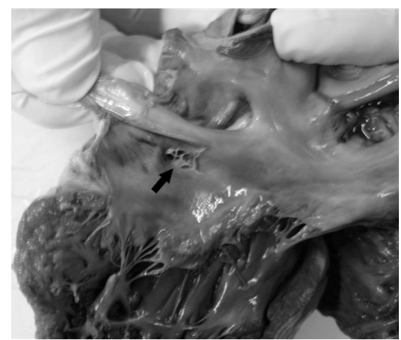
Fig. 2 Specimen photograph shows a fenestrated membrane at the sinus coronarius (arrow).

year-old cadaver; 160 cm tall and weighed 50 kg. On gross physical examination, there were defibrillator-related burn areas on the chest wall and needle puncture sites on the back of the right hand and the cubital fossa. Autopsy macroscopic examination revealed petechial subpleural haemorrhages on interlobar surfaces of both lungs, while microscopic investigation detected oedema and congestion. The brain appeared normal on histopathological examination.