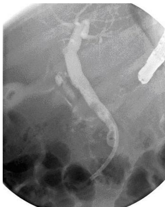
Fig. 1 ERCP shows several filling defects within a prominent CBD, suggestive of ductal calculi.

Numerous studies, including the European Association of Endoscopic Surgery (EAES) multicentre prospective randomised trial by Cuschieri et al, have shown equal efficacy in terms of ductal stone clearance for these two management options. (2,3) The latter option is especially attractive in cases of difficult choledocholithiasis (which refers to cases of failed endoscopic stone retrieval), where common bile duct exploration during cholecystectomy is required. Causes of failed endoscopic stone retrieval can be divided into two main groups: (1) failure of cannulation (difficult anatomy due to previous gastrectomy, or due to periampullary diverticulum), and (2) failure of extraction (due to reasons such as impacted stone, CBD stricture).