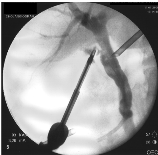
Fig. 3 IOC shows multiple filling defects in the CBD.

between the endoscopist and the surgeon, ERCP was performed. This showed a very distally sited major papilla (Fig. 1), inside a small diverticulum (Fig. 2), resulting in difficult biliary access. Cholangiogram revealed filling defects in a mildly-dilated CBD. A plastic biliary stent (10Fr 9 cm) was placed with good drainage but sphincterotomy could not be safely performed to allow stone removal.