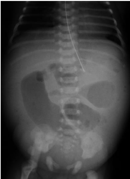
Fig. 3 Abdominal radiograph shows dilated small bowel loops in the neonate.

to the foetal medicine unit in our hospital. Repeat ultrasonography at 15 weeks at our hospital confirmed a monochorionic monoamniotic twin pregnancy, complicated by an acardiac twin with acardiac acephalus malformation, short abnormal limbs and an omphalocele (Fig. 1). There was also reversed perfusion through the umbilical artery towards the