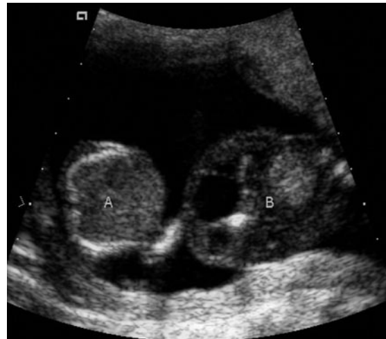
Fig. 1 Antenatal US image taken at 15 weeks gestation shows a cardiac mass (A) and the pump twin (B).

Acardiac twin pregnancy is caused by reversed arterial perfusion through vascular anastomoses between two cord insertions in a monochorionic placenta, characterised by a partial or complete lack of cardiac development in one of the twins. (1) Acardiac twin pregnancies are at risk of miscarriage and preterm labour associated with perinatal morbidity and mortality. The pathophysiology of such complications are mediated through increased blood flow through the acardiac twin, especially when the mass is large, resulting in possible polyhydramnios and hydropic changes in the pump twin. As such, treatment for acardiac twin pregnancy is indicated when poor prognostic signs, such as increased mass of acardiac twin, polyhydramnios and hydrops, are present. In the absence of such poor prognostic signs, it remains