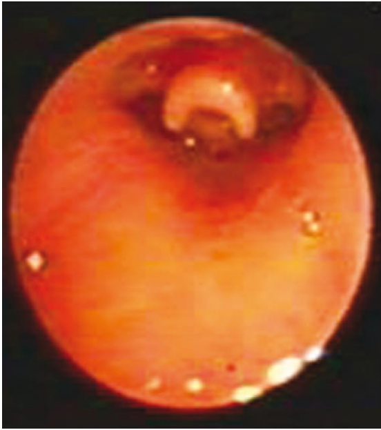
Fig. 2 Bronchoscopic photograph shows the oropharynx appearance with positive airway pressure of 5 cm water.

oral feeding well and there was no desaturation. The inspiratory stridor completely subsided at six weeks of age.