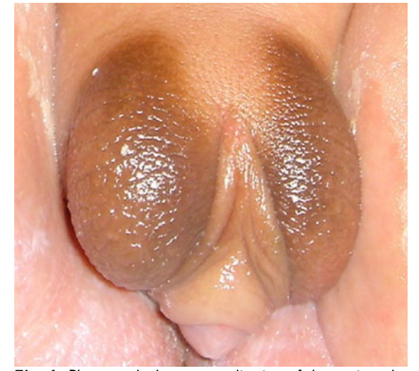
Fig. | Photograph shows scrotalisation of the penis and a shawl-like scrotum.