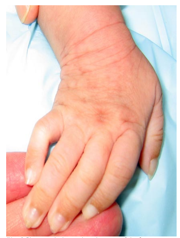
Fig. 3 Photograph shows ulnar deviation of the fingers.

23.80 \rho mol/L) and thyroid stimulating hormone was 1.88 \mu IU/ml (normal range 0.32–5.00 \mu IU/ml). His chromosome karyotype was 49,XXXXY (Fig. 4), while those of his parents were normal. Hearing test, as well as cranial and renal ultrasonography, revealed no abnormalities. On follow-up, his serial growth parameters were noted to be falling off the centiles. At 18 months of age, his body length, weight and head circumference corresponded to the third percentile of a 14-month-old, ten-month-old, and 11-month-old, respectively. His right testis was 0.5 ml, while his left testis was very small and firm