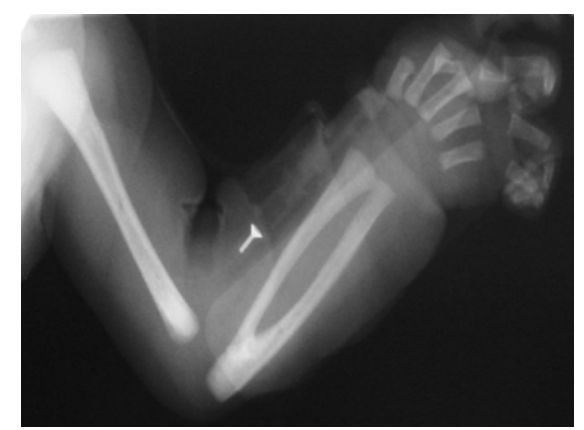
Fig. 2 Radiograph shows classical proximal radioulnar synostosis.