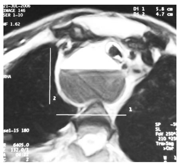
Fig. 3 Axial T2-W MR image shows a fluid-fluid level with two different intensities within the mass.

to the left and a mild interstitial infiltrate at the right base (Fig. 1). Cranial radiographs showed radiolucent areas suggesting hyperparathyroidism-related bone involvement. Computed tomography (CT) revealed a right medial mediastinal mass with tracheal and superior vena cava displacement to the left and right, respectively. Posterolateral oesophageal displacement and bilateral alveolointerstitial infiltrates predominating in the right base were also noted (Fig. 2). Due to dysphagia and suspicions of an aspiration pneumonia, an oesophageal transit using X-ray fluoroscopy was performed; this showed a remarkable lumen displacement due to extrinsic compression of the oesophagus and massive aspiration of barium contrast in the first few swallows. The procedure was therefore terminated.