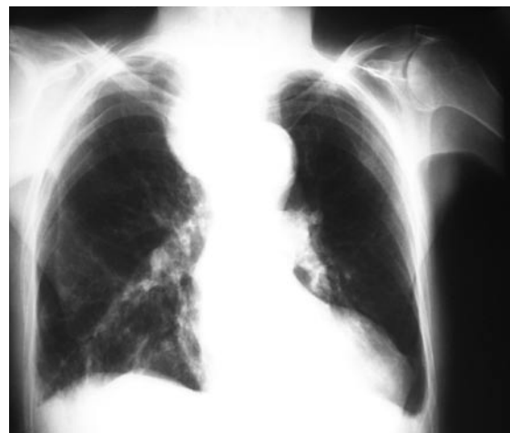
Fig. 1 Chest radiograph shows superior right-sided mediastinal widening, tracheal displacement and a mild interstitial infiltrate at the right base.