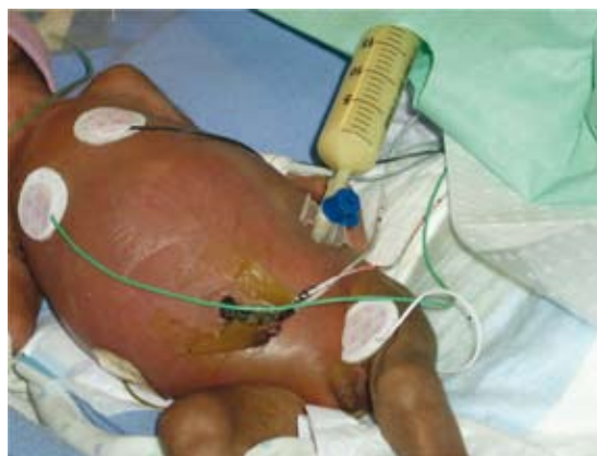
Fig. 1 Photograph shows an intraperitoneally extravasated total parenteral nutrition infusate delivered via a malpositioned umbilical venous catheter tip in the liver. A total of 135 ml of the infusate was removed by paracentesis.

A size 5-F double-lumen silicon catheter (Utah Medical Products, West Midvale, UT, USA) was inserted into the umbilical vein of a preterm male infant of 27 weeks gestation, without much difficulty. The infant weighed 1,100 g. The tip of the UVC was confirmed to be at the level of the 11th thoracic vertebra on plain radiograph. From day one of life, TPN was commenced by continuous infusion through the UVC. Enteral feeds of 1 ml every three hours was started at day two of life, and was subsequently increased to 1.5 ml every three hours the next day. However, a day later, he appeared lethargic and