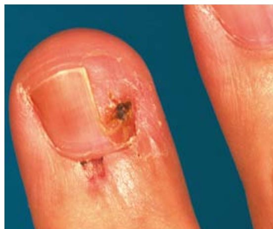
Fig. 1 Clinical photograph shows subungual squamous cell carcinoma after exploratory nail plate removal.

A 43-year-old Chinese man on regular attendance at our dermatology department for lichen amyloidosis of the legs presented with a three-year history of an asymptomatic, stable discolouration affecting his left fourth fingernail. Previous cultures excluded onychomycosis. Examination revealed a 3-mm linear pigmented band at the distal radial aspect of the nail bed, extending to the distal nailfold with subungual hyperkeratosis. There was no history of immunosuppression or trauma. Systemic examination was unremarkable. Clinically, the differential diagnoses of melanotic macule or subungual melanoma were considered.