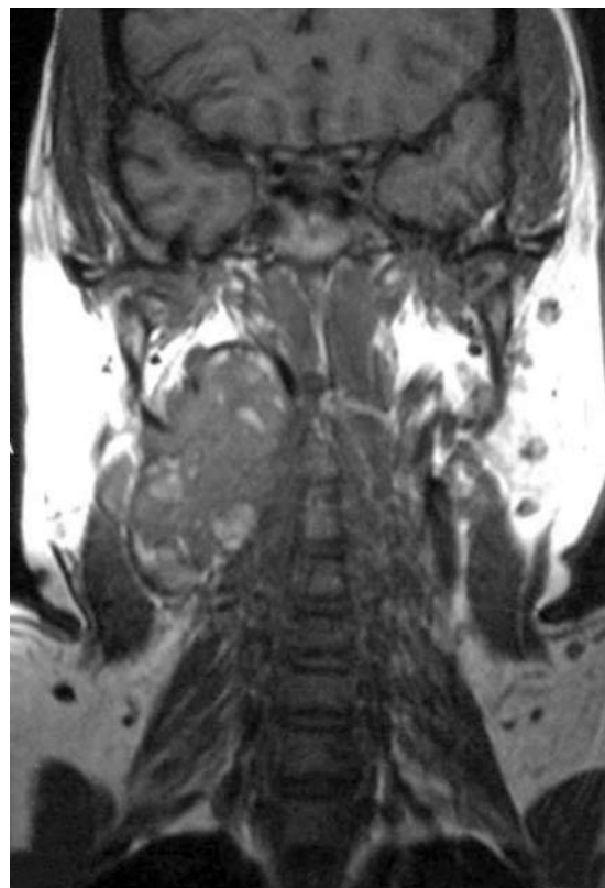
Fig. 1 Coronal T1-W MR image shows the ectopic thyroid tissue in the right parapharyngeal space at the level of the bifurcation of the common carotid artery.

Computed tomography (CT) of the neck prior to admission had shown a mass in the parapharyngeal region. Magnetic resonance (MR) imaging of the neck and thorax showed a heterogenous mass with multiple areas of necrosis, seen at the right carotid bifurcation (Figs. 1 &