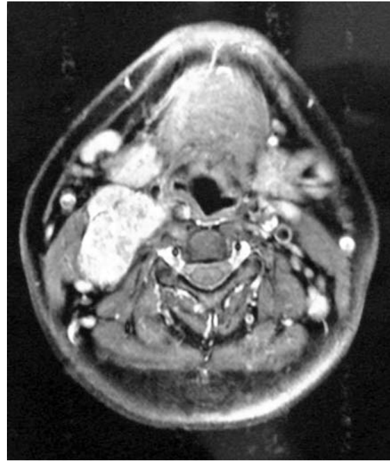
Fig. 3 Axial T2-W MR image shows that the parapharyngeal space is obliterated, pushing the tracheal wall medially, which may explain the patient's symptom of occasional dyspnoea.

The treatment of ectopic thyroid depends on its location, size and on the presence of symptoms or