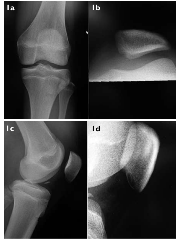
Fig. I (a) Frontal, (b) skyline, (c) lateral and (d) close-up lateral radigoraphs show an oval loose body located in the anterior intercondular area. There is also a defect in the medial facet of the patella.

A 15-year-old schoolboy presented to our clinic with sudden onset of locking of his left knee. One day prior to the presentation, the patient had been practising dancing in school when he thought he had "twisted" his left knee, which promptly gave way and caused him to fall on the stage. Immediately after the fall, he found his left knee to be swollen and locked in extension; this remained so until he was seen in the clinic.