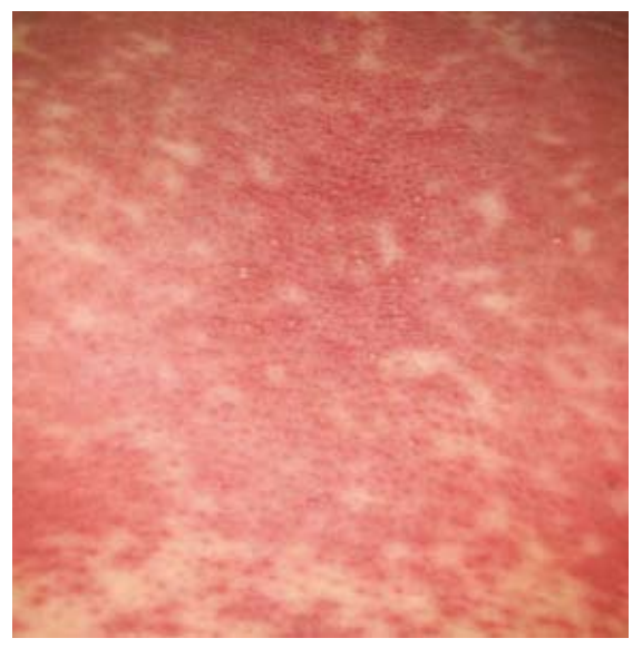
Fig. 4 Photograph shows non-follicular pustules over the chest.

Her total white blood cell count was 4 \times 10^9/\text{uL} (normal 4-10 \times 10^9/\text{uL} ). No atypical lymphocytosis or