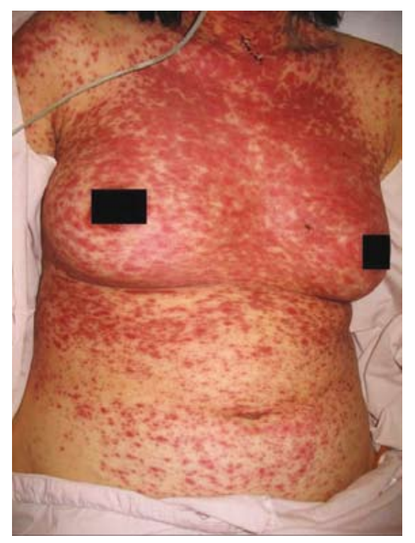
Fig. I Photograph shows confluent erythema of the trunk.

A 28-year-old Chinese woman presented in December 2005 with a rapidly progressive generalised eruption with fever. She had history of childhood epilepsy and was on antiepileptic medication previously until the age of nine years. She was unable to provide the name of the medication. She had a past history of drug exanthem to erythromycin and doxycycline. She had no personal or family history of skin problems, such as psoriasis. She was started on carbamazepine on November 24, 2005 for recurrence of seizures. She developed a macular rash, fever and mouth ulcers on December 7, 2005 (14