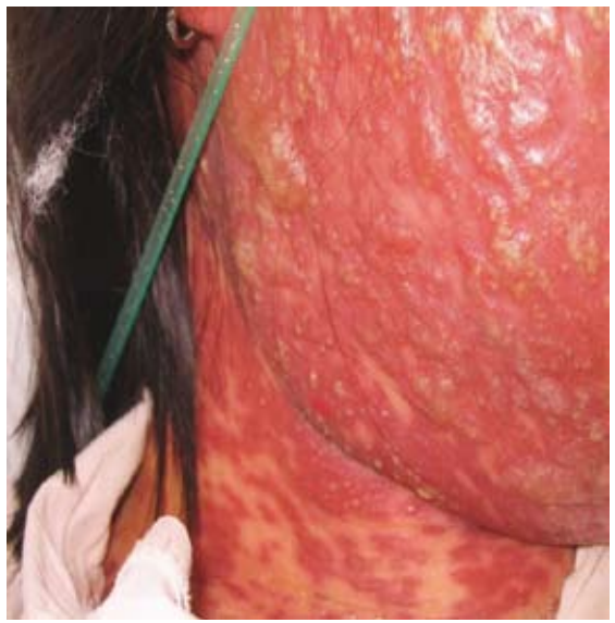
and face. Some pustules on the face has coalesced, forming purulent bullae.