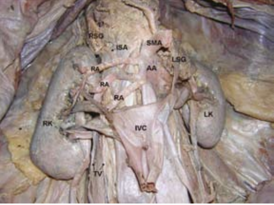
Fig. 2 Photograph taken during dissection shows the right renal arteries and veins. The inferior vena cava is reflected downwards. SMA: superior mesenteric artery; RA: right renal arteries; ISA: right inferior suprarenal artery; AA: abdominal aorta; IVC: inferior vena cava; RSG: right suprarenal gland; LSG: left suprarenal gland; RK: right kidney; LK: left kidney; TV: right testicular vessels.

IVC: inferior vena cava; RK: right kidney; RA: right renal arteries; RV: right renal veins; TA: testicular artery; TV: testicular vein; RSG: right suprarenal gland; RU: right ureter.