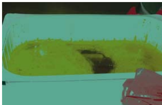
Fig. 1 Photograph shows the frothy bilious fluid coughed up by the patient.

Bronchobiliary fistula is a rare condition, arising as a complication of hydatid disease of the liver, hepatic tuberculosis (TB), hepatic malignancy, chronic pancreatitis, hepatic trauma or surgery. (1-5) Patients with bronchobiliary fistula characteristically present with recurrent biliptysis, and in the chronic stage, develop bronchiectasis of the involved segment of the lung. (6) Medical or non-surgical therapy is directed at relieving pressure in the biliary system and allowing for free drainage of bile into the duodenum with endoscopic retrograde cholangiopancreatography (ERCP) and biliary stenting or via percutaneous methods which can resolve the fistula in most patients. (7-9) However in some patients, particularly those with bronchiectatic