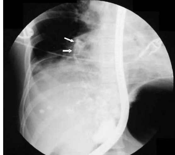
Fig. 2b ERCP image shows the bronchobiliary fistula between segment 8 of the liver and the right middle lobe (white arrows).

1,600 mg/dL. A diagnosis of bronchobiliary fistula was made. The patient was kept fasted and started on an intravenous infusion of synthetic somatostatin (Stilamin) to reduce biliary secretion.