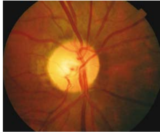
Fig. 3 Photograph shows a pale optic disc (optic atrophy) as seen in late anterior and/or retrobulbar ON.

hospital subspecialty clinics at Tan Tock Seng Hospital, Singapore National Eye Centre, National University Hospital and Changi General Hospital. Patients were, in most instances, referred from general ophthalmology clinics either on the same day for urgent cases, or given an appointment for the next available specialty clinic.