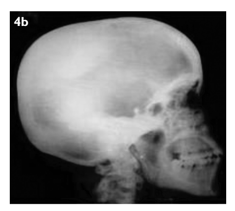
Fig. 4 Characteristic radiological changes of Albers-Schönberg disease in one of the elder sisters, consisting of (a) rugger-jersey spine; (b) increased radiodensity of the skull base and calvaria; and (c) resorption of the left femoral head and severe coxa vara deformity.

postero-anterior view of the chest (Fig. 3b). In the lateral radiograph of the spine, a band of increased radiodensity was seen at the vertebral margins (ruggerjersey spine / sandwich vertebra), along with fracture of the pars interarticularis (spondylolysis) at the lumber fourth and fifth vertebrae, and spondylolisthesis at L5/S1 level (Fig. 3c). Anteroposterior radiograph of the hips and pelvis revealed a "bone-withinbone" appearance, which is typical of osteopetrosis seen in iliac bones. There were also resorptions of both the femoral heads associated with severe coxa vara deformity and beak-shaped greater trochanters bilaterally. A non-united fracture was seen in the right neck of femur (Fig. 3d). A provisional diagnosis of osteopetrosis was made. During a radiological skeletal survey of the family members (the mother, two elder sisters and one younger sister), one of the elder sisters and the younger sister were found to be affected with characteristic rugger-jersey spine, increased radiodensity of the skull, resorption of the left femoral head with coxa vara deformity (Fig. 4a-c, elder sister)