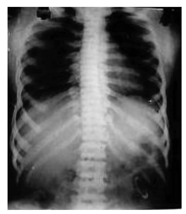
Fig. 5 Radiograph of the younger sister shows a rugger-jersey spine and increased radiodensity of the ribs.

non-traumatic fractures, especially of long bones, cranial nerve palsies, osteoarthritis of the hip and mandibular osteomyelitis.<sup>(7)</sup> Femoral shaft fractures, either with transverse or short oblique pattern, are the most common. Other common locations are inferior neck of femur and posterior tibia. Upper extremity fractures have also been reported. The fractures may have delayed healing.<sup>(7)</sup> The radiological penetrance is as high as 90% in some series and is increased after the age of 20 years.<sup>(7)</sup> There have only been seven reported cases of spondylolysis associated with osteopetrosis.<sup>(8)</sup> ADO II manifests radiographically with a segmentary osteosclerosis, predominantly at the vertebral endplates (rugger-jersey spine), iliac wings (bone-within-bone sign) and skull base.<sup>(3)</sup> A gene residing in chromosome 16p13.3 encoding the ClCN7 chloride channel,<sup>(9)</sup> essential for the acidification of the extracellular resorption lacuna of osteoclast,(10) is mainly defective in ADO II.