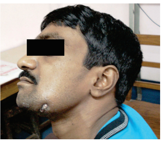
Fig. I Photograph shows the sinus over the jaw exuding creamy yellow pus.

A 24-year-old man presented to our outpatient department with a complaint of a discharging sinus from the left side of his chin for the last five months. He had visited several dentists and physicians during this period, and has completed multiple courses of antibiotic therapy without any result. The sinus exuded creamy yellow pus from time to time, the amount of which was scanty throughout. There was neither any history