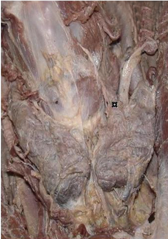
Fig. 1 Photograph taken at the front of the neck shows the pyramidal lobe of the thyroid gland (✱).