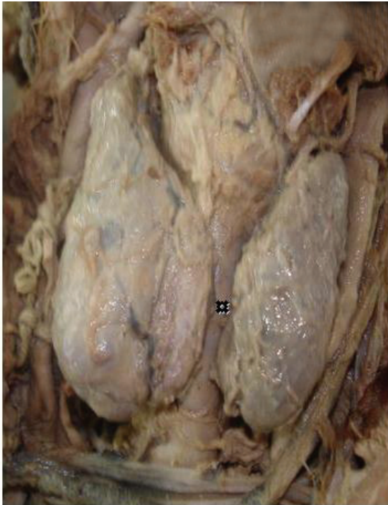
Fig. 3 Photograph taken at the front of the neck shows the absence of isthmus of the thyroid gland (✕).

parotid gland has been reported by Mysorekar et al, who explained that the ectopic thyroid tissue in the parotid gland could be due to a common evolution of the thyroid and parathyroid glands. (25) The presence of thyroid tissue within the tracheal lumen is an unusual cause of upper respiratory obstruction. Thyroid tissue in this location may be a true ectopic tissue or may be caused by the invasion of the trachea by a malignant process. (26)