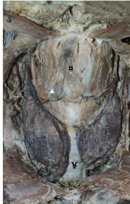
Fig. 4 Photograph taken at the front of the neck shows the ectopic thyroid tissue (□), absence of isthmus of the thyroid gland (✕), and the arterial supply to the ectopic tissue (▲).

According to Gregory and Guse, Soemmerring's levator glandulae thyroideae is an accessory muscle which runs from the hyoid bone to insert partly on the thyroid cartilage and partly on the isthmus of the thyroid gland. (27) Merkel thought that the levator glandulae was constant and glandular though usually surrounded by muscle fibres. (28) Huschke spoke of the structure only as glandular, mentioning nothing about the muscle. (29) Bourguery described and illustrated a muscle, which he called "hyo-thyroidien", occupying the place of the pyramidal lobe. (30) Finally, Godart reported a case in which the structure was indeed muscular, on the basis of the nitric acid test for muscle. (31) Soemmerring's muscle is the same as the hyo-thyro-glandulaire of Pointe, the levator glandulae thyroideae superficialis medius et longus of Krause, (32) and the musculus thyroideus of Merkel; its usual full name in the literature is levator glandulae thyroideae of Soemmerring. Saadeh et al reported an unusual levator glandulae thyroideae on the left side of the neck in a female cadaver. It arose from the mastoid process, extended superficially to the superior belly of the