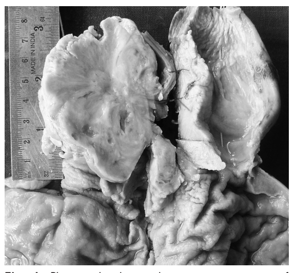
Fig. I Photograph shows the gross appearance of carcinosarcoma of the oesophagus situated above the gastrooesophageal junction. Longitudinally-cut section shows areas of necrosis and the tumour stalk.

A 43-year-old man presented with a history of progressive dysphagia for two months, increasing up to grade IV (able to ingest only liquids),<sup>(3)</sup> with significant loss of weight. The patient was a known smoker for the past ten years. He was investigated for dysphagia by barium swallow and oesophageal endoscopy, both revealing a large polypoidal growth in the lower third