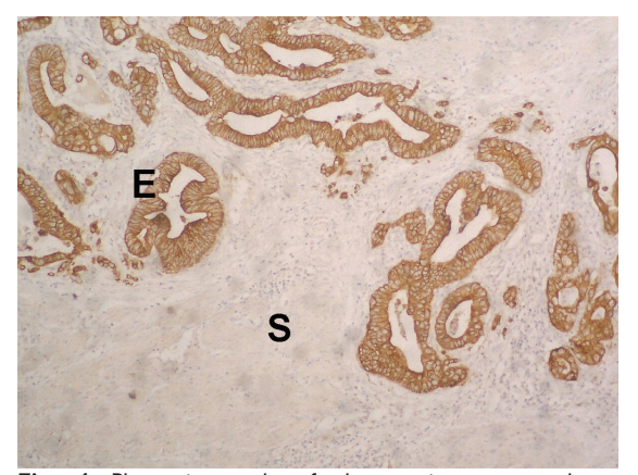
Fig. 4 Photomicrograph of the carcinosarcoma shows immunomarker cytokeratin positivity in the adenocarcinomatous epithelium (E). Sarcomatous component (S) is negative for cytokeratin. (Anti-cytokeratin [Lu-5] with DAB chromogen, counterstain Harris' haematoxylin, × 400).

of carcinosarcoma of the oesophagus was made, based on gross and microscopical features along with immunohistochemistry results.