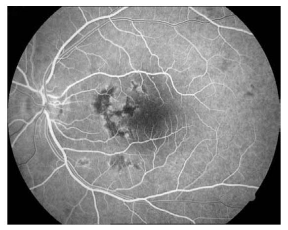
Fig. 2 Early phase fluorescein angiogram of the left eye shows plaques blocking the fluorescence.

for a wide range of viruses were all unremarkable. There was no proteinuria. His vasculitic and thrombophilic screens were unremarkable. The angiotensin converting enzyme assay was normal. HLA-B27 was negative. Due to technical difficulties, only sufficient cerebrospinal fluid was obtained for a cell count: this showed 114 erythrocytes \times 10 ^6 /L and 2 polymorphonuclear cells \times 10 ^6 /L. Magnetic resonance imaging and magnetic resonance angiography of the brain were unremarkable.