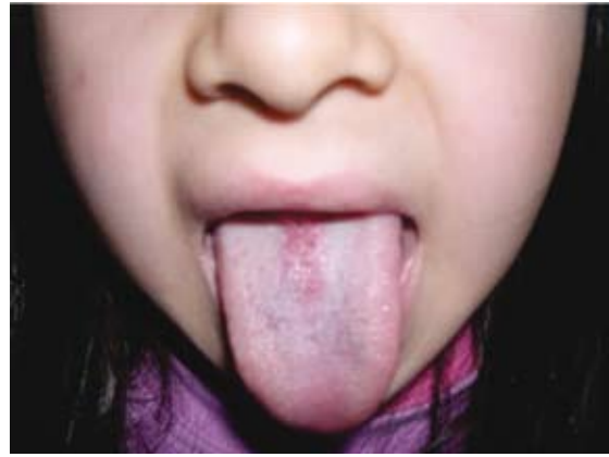
Fig. 3 Postoperative photograph of the tongue.

never encapsulated. Lesions are subdivided into several categories: capillary haemangioma, cavernous haemangioma, epithelioid haemangioma, intramuscular haemangioma and sinusoidal haemangioma. Haemangiomas comprise numerous intertwining vessels lined by endothelium with relatively flat or plump nuclei, depending on the duration of the lesion.