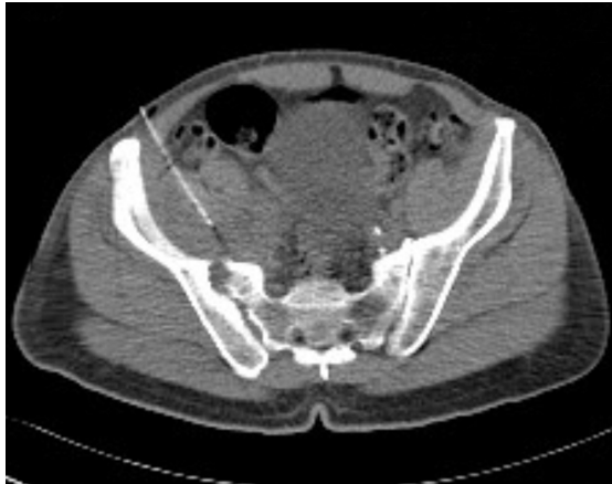
Fig. 2 CT-guided drainage of the right sacroiliac joint of the first patient.