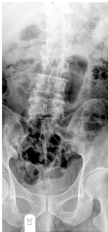
Fig. 1 Initial anterior-posterior radiograph of the first patient.

is meant to be administered sublingually. However, in 2005, news broke of addicts creating a new drug cocktail of Subutex crushed together with Dormicum (benzodiazepine) and administering it intravenously. Singaporean drug users had thus devised a method to abuse an otherwise extremely effective drug in the treatment of heroin withdrawal symptoms. (1) As a result, Subutex became a Class A controlled drug, which subjects traffickers and illegal dealers to 20 years in jail and 15 strokes of the cane. Addicts were given a two-week window to sign up for a voluntary rehabilitation programme in which they were weaned of the drug in a controlled environment.