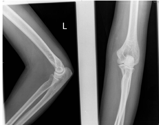
Fig. 3 Radiographs of the left elbow of the second patient.