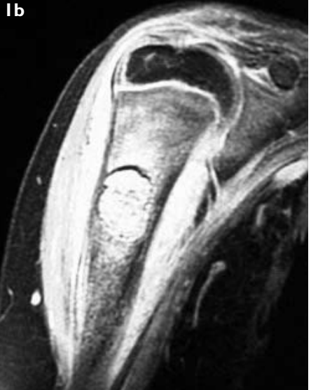
Fig. I (a) AP radiograph of the right proximal humerus shows a large osteolytic lesion in upper humeral diaphysis with prominent periosteal reaction. There is cortical destruction of the medial cortex and a pathological fracture. (b) Enhanced fat-saturated coronal T1-weighted MR image shows the added information of a markedly-enhancing lesion in the diaphysis with extensive bony and soft tissue oedema.

there is however little diagnostic dilemma between these two entities as lesions larger than 2 cm are considered osteoblastomas and those smaller than 2 cm are considered osteoid osteomas. Based on this criteria,