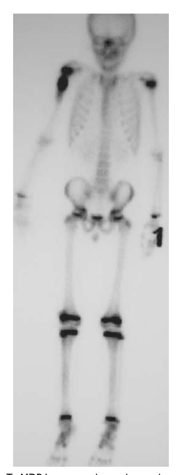
Fig. 2 99m Tc-MDP bone scan shows abnormal uptake at the right proximal humeral shaft. There is no other site of abnormal uptake.

osteoid osteomas are considerably more prevalent than osteoblastomas. The humerus is a very rare site. Despite its benign nature, the tumour may sometimes exhibit aggressive behaviour and is therefore typically treated with curettage and packed with a bone or a bone substitute. We present an unusually aggressiveappearing osteoblastoma located at the rare site of the proximal humeral diaphysis.